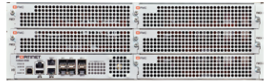
FortiGate-3950B Appliance (Front)