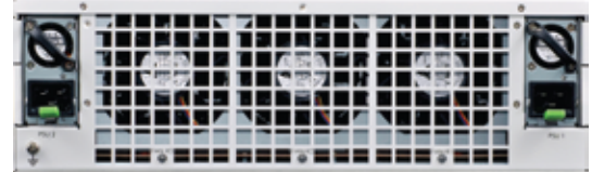
FortiGate-3950B/3951B Appliance (Rear)