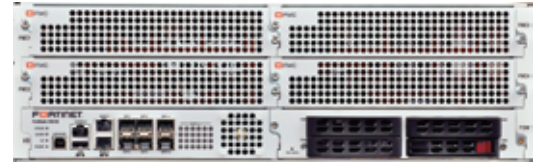
FortiGate-3951B Appliance (Front)