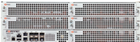
FortiGate-3950B Multi-Threat Security Appliance