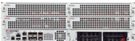
FortiGate-3951B Multi-Threat Security Appliance