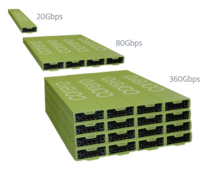
SmartWall® Threat Defense System

10Gbps full-duplex or 20Gbps unidirectional performance in a 1/4 wide, 1 RU form factor with scalability from 10/20Gbps up to 2Tbps in single rack.