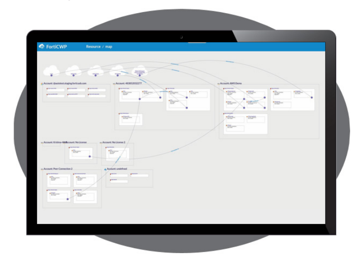
FortiCWP Resource Mapping

FortiCWP's deep risk assessment and continuous analysis solution enables security teams to focus on the highest priority issues, take quick remediation as well as utilizing auto fixing option to effectively manage and address risk. Actionable alerts enable organizations to prioritize response based on the severity of the issues. To help assess risk, FortiCWP generates a security risk score.