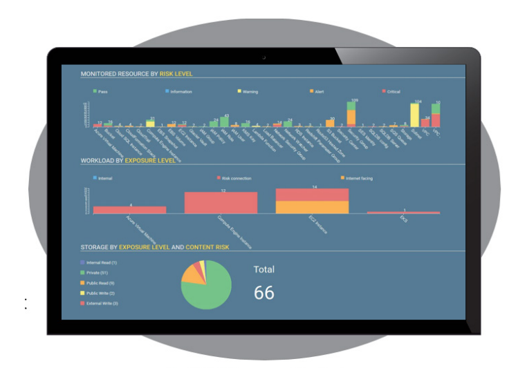
FortiCWP Resource Monitoring

FortiCWP offers a highly customizable suite of data loss prevention tools that defend against data breaches and provides a set of predefined compliance reports. Using industry-standard regular expressions, FortiCWP can be configured for nearly any policy to meet data protection needs and provide tailored reports on DLP activities. For organizations that must meet compliance standard, FortiCWP offers predefined reports for standards including PCI, HIPPA, SOX, GDPR, ISO 27001, and NIST which allows organizations to generate compliance reports instantly for auditing teams, so policy violations can be identified and remediated.