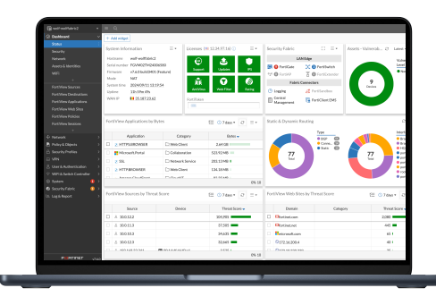
Comprehensive view of network performance, security, and system status