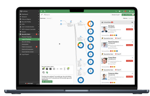
Intuitive easy to use view into the network and endpoint vulnerabilities

Learn more about what's new in FortiOS. <a href="https://www.fortinet.com/products/fortigate/fortios">https://www.fortinet.com/products/fortigate/fortios</a>