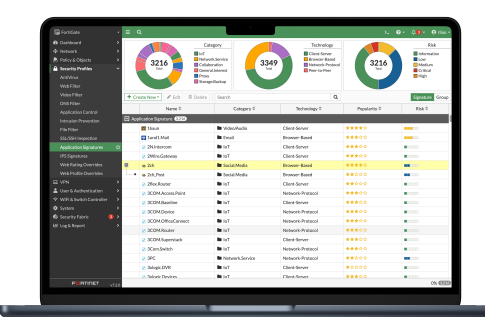
Visibility with FOS Application Signatures