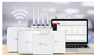
Secure Cloud Wi-Fi